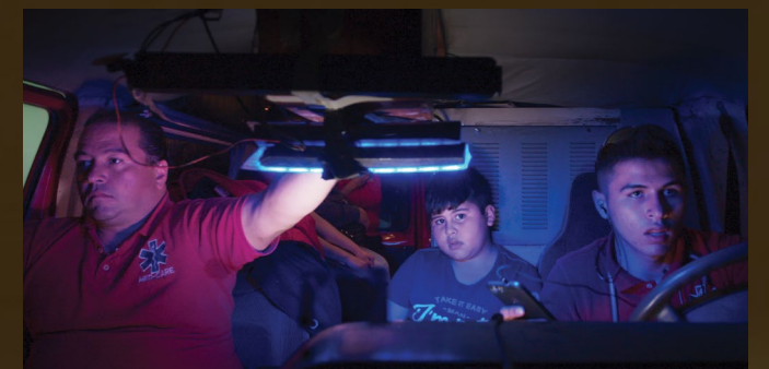
Still from Midnight Family.

Advanced Young Filmmakers, 2009 Young Documentary Filmmakers, 2008