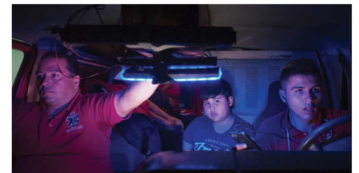
Still from Midnight Family. © Luke Lorentzen

Advanced Young Filmmakers, 2009 Young Documentary Filmmakers, 2008